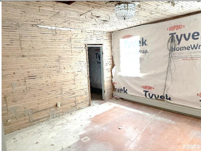
Upper-level Bedroom 3 – remediated and showing the original lath