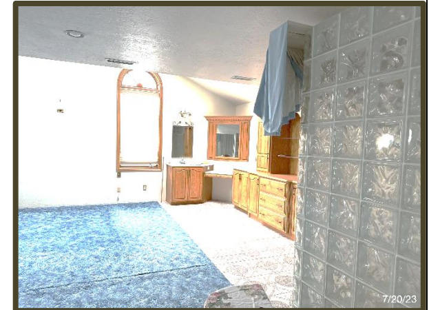
The dressing room and bath area of the primary suite including the glass brick shower stall to the right.