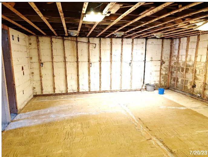
Basement family/recreation room – where the water finished its journey in the house.