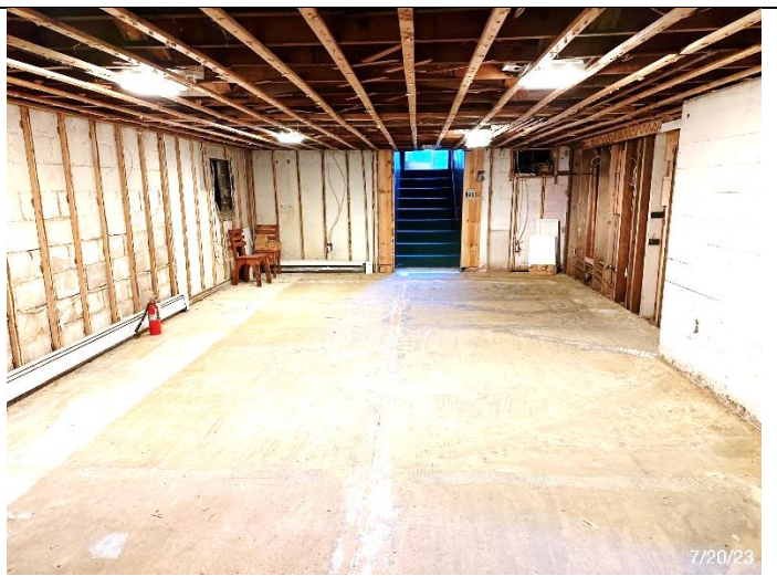
The basement family room with carpet, wall finish, and ceiling drywall removed by remediation firm; ready for a new look!