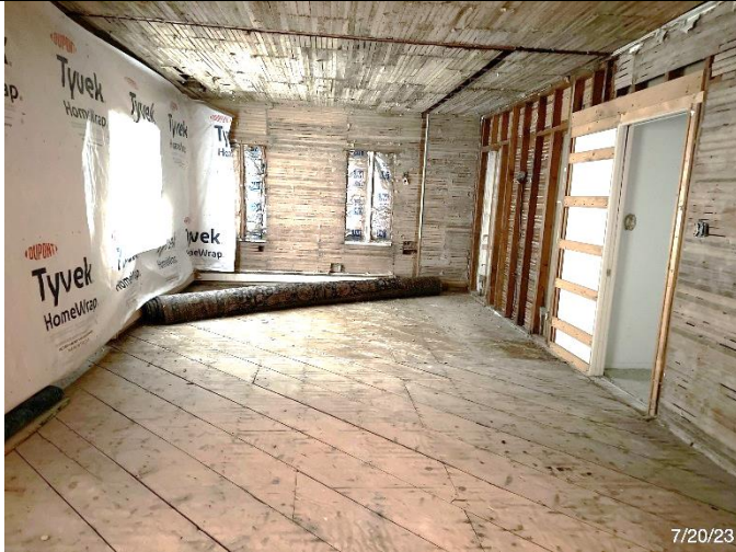
The Living Room after water remediation.

Now, for the rest of the story! As unoccupied houses will do at times, a pipe break on the upper level sent water cascading down to the basement, damaging everything the water could touch in its gravitational journey.