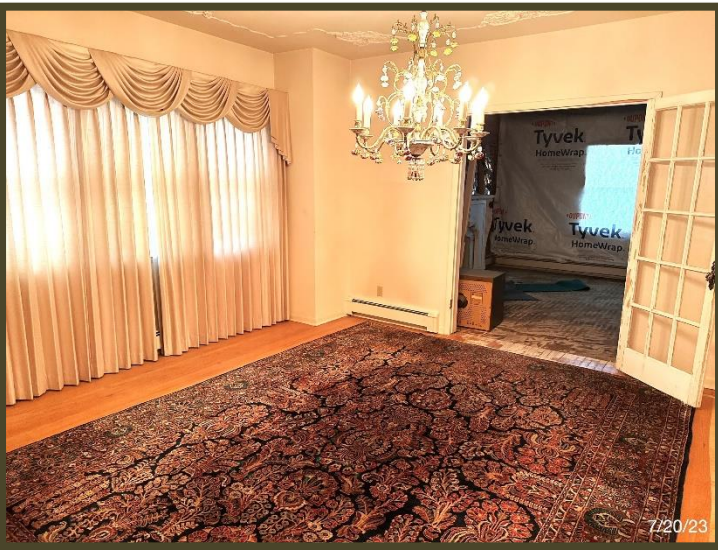
The formal dining room and the bedroom area of the primary suite.