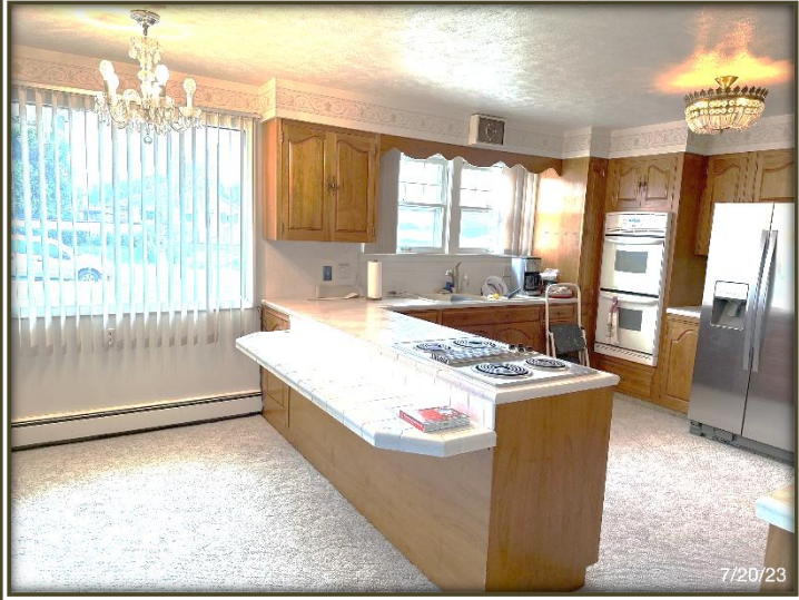
The kitchen with electric cooktop, dual wall oven, and refrigerator.