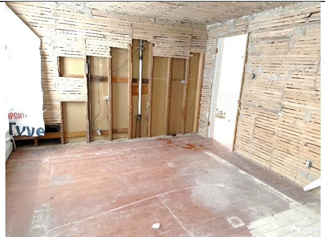
Bedroom 3 upstairs with the culprit revealed and repaired.