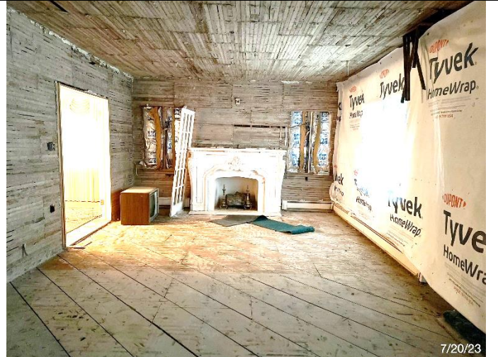
The fireplace end – showing walls, floor, and ceiling stripped down to the original bare wood.